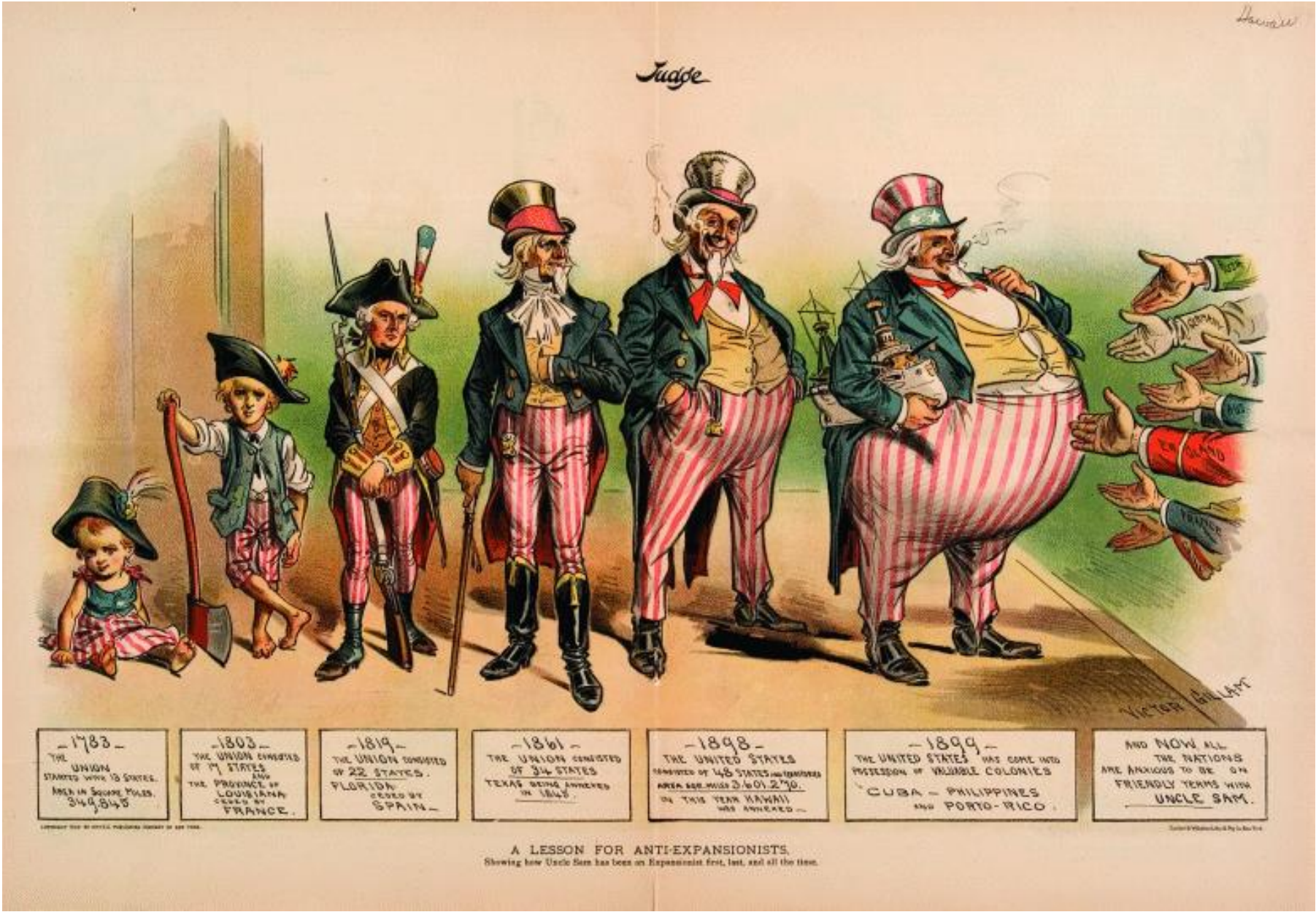
Summarize the cartoon above