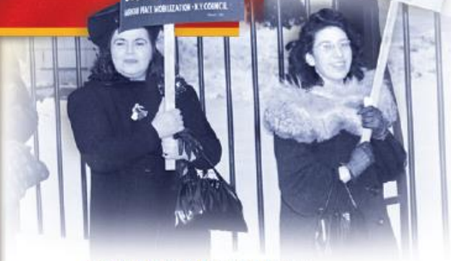
▲ Women protesting the Lend-Lease Act

MOTHERS! STOP H.R. 1776 TO SAVE YOUR SONS. APAK JOURNAL