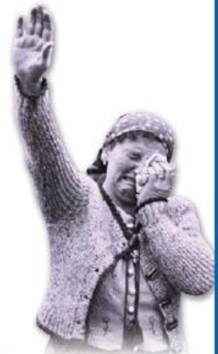
A woman weeps as she salutes her new rulers.

The next storm erupted with raging fury in the spring of 1940. Germany's nonaggression pact with the Soviet Union freed Hitler to send his army west. On April 9, 1940, Germany attacked Denmark and Norway. The two countries fell almost immediately. On May 10, he sent his blitzkrieg forces into the