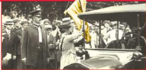
▲ Civil Disobedience and Arrests Alice Paul continued to lead protests in front of the White House. She and 168 others were arrested and jailed.

The Nineteenth Amendment Becomes Law When the United States entered World War I in 1917, Carrie Catt and Florence Kelley led the NAWSA to support the war effort. Their actions and those of the NWP convinced a growing number of legislators to support a women's suffrage amendment. In June 1919, Congress approved the Nineteenth Amendment , which stated that the right to vote "shall not be denied or abridged on account of sex." On August 18, 1920, the