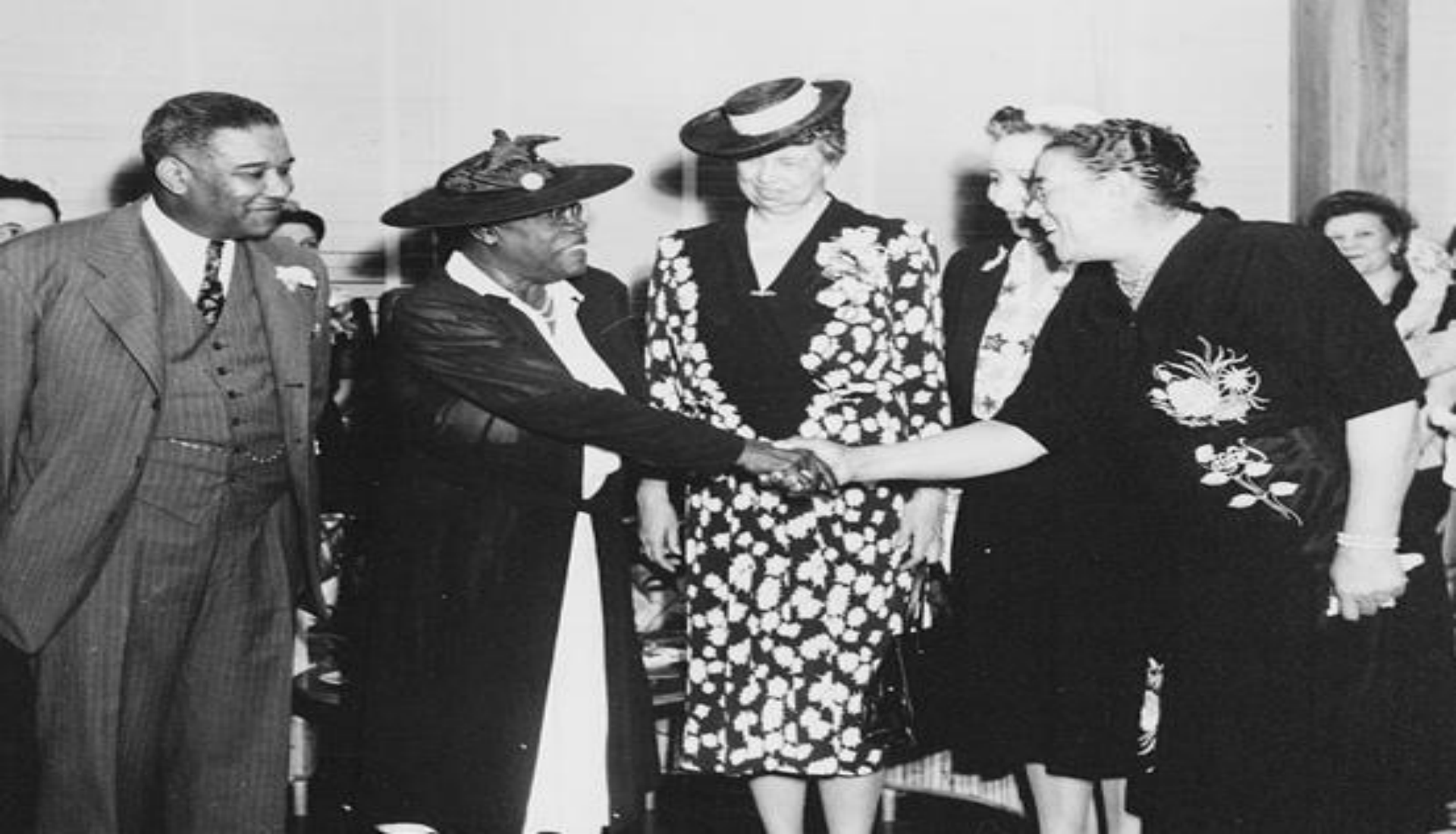
Eleanor Roosevelt standing with Mary Bethune. Bethune served with FDR to help African Americans.