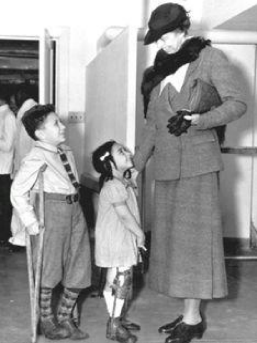
Eleanor Roosevelt visiting a children's hospital.