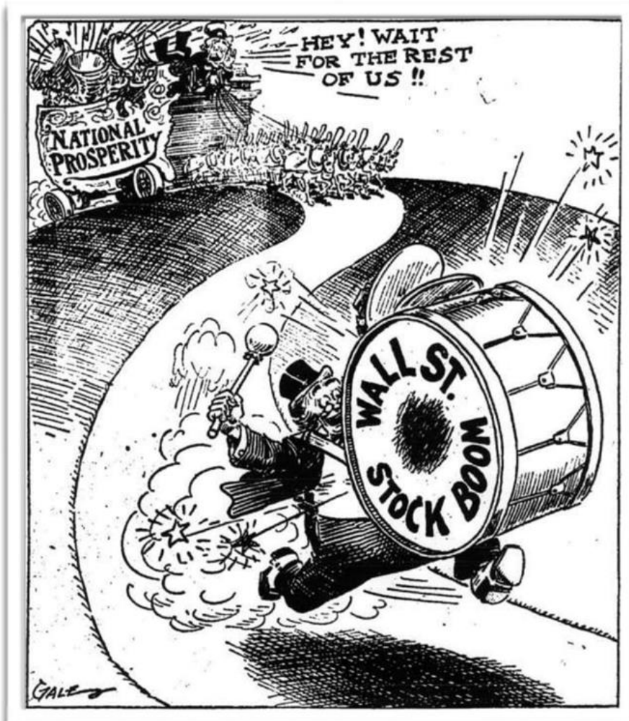
"Getting Ahead of the Bandwagon!", The Los Angeles Times, (November 24, 1928)