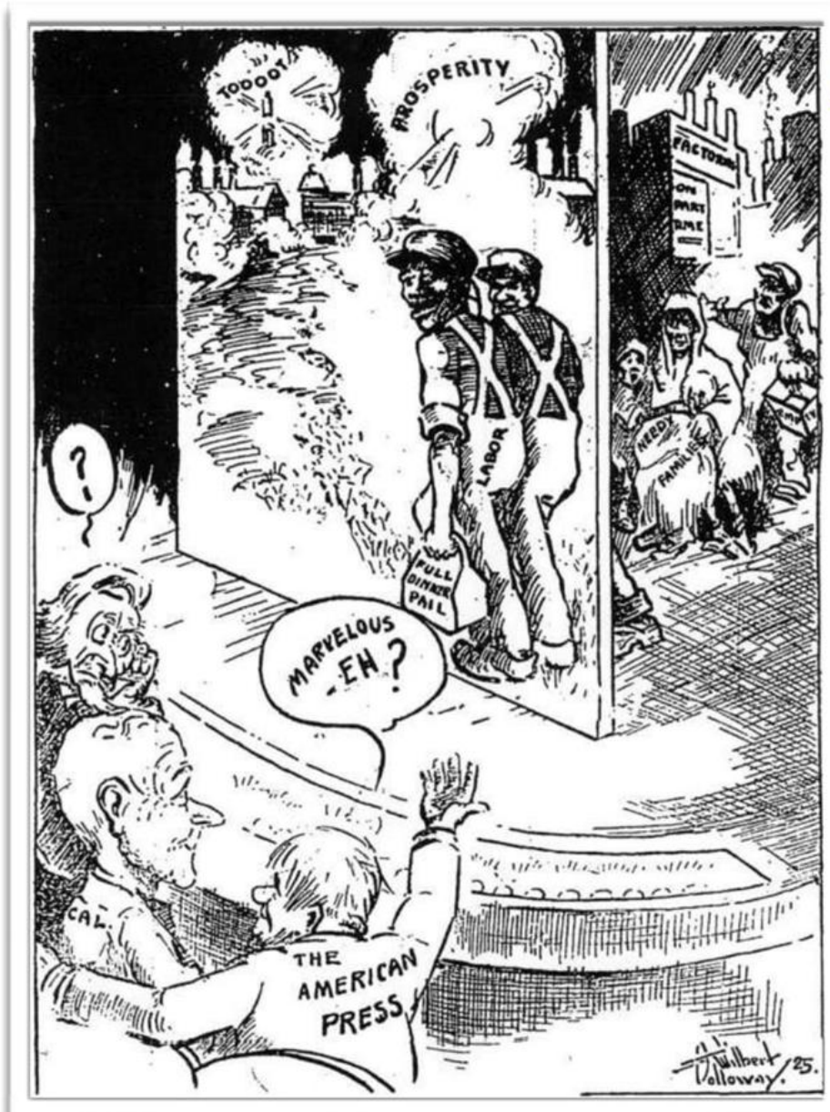
"It's Hard to Fool Those Backstage", The Pittsburgh Courier, (June 13, 1925)

The setting is a playhouse, with President Calvin Coolidge seated in the front row, accompanied by Uncle Sam and the American Press (media). They are watching a production of a day in the life of everyday Americans in the thriving 1920s economy. Workers happily drudge to work with smiles on their faces and Full dinner pails, while steel factories puff smoke and American production is humming. However, it is a facade, covering the reality behind the external signs of economic success. The reality hidden behind the facade is that of a struggling working class, lining the streets with little food, shelter, and clothing, while factories only hire "part time" labor at wages that are far below what it takes to live day to day.