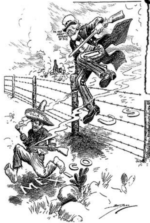
I've Had About Enough of This

https://www.youtube.com/watch?v=CesHr99ezWE