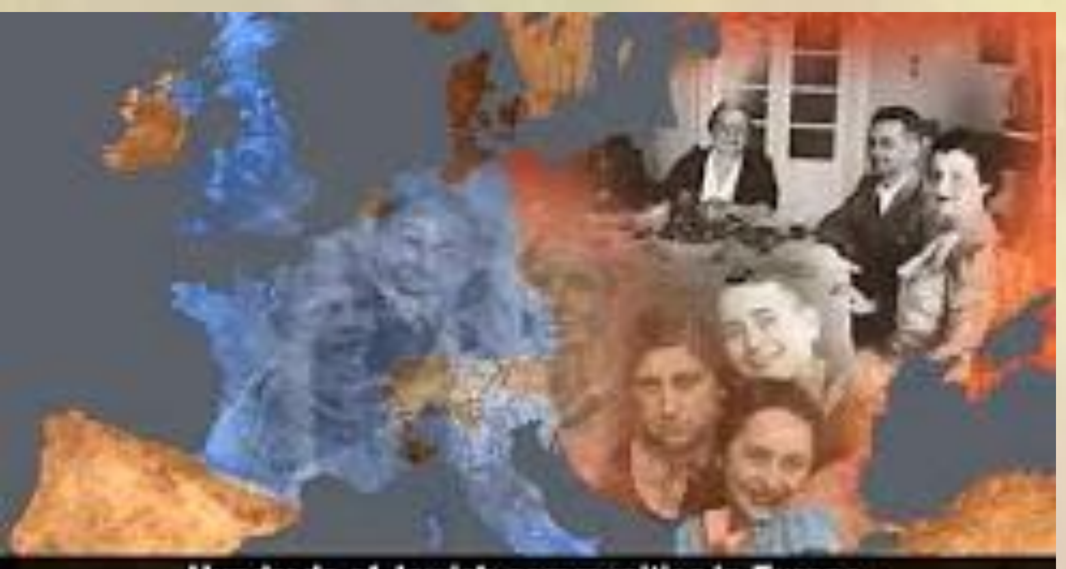
Hundreds of Jewish communities in Europe,