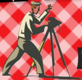
PHOTO GALLERY ACTIVITY