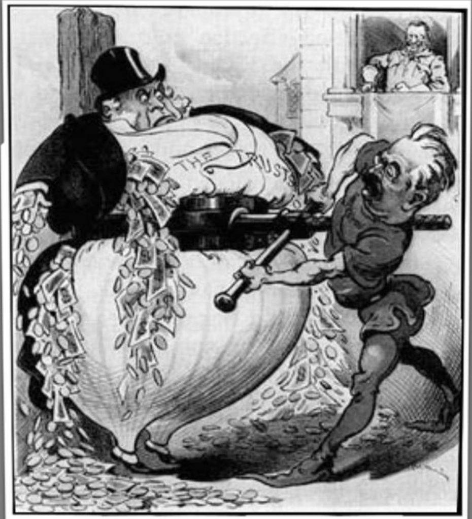
SQUEEZING THE TRUSTS