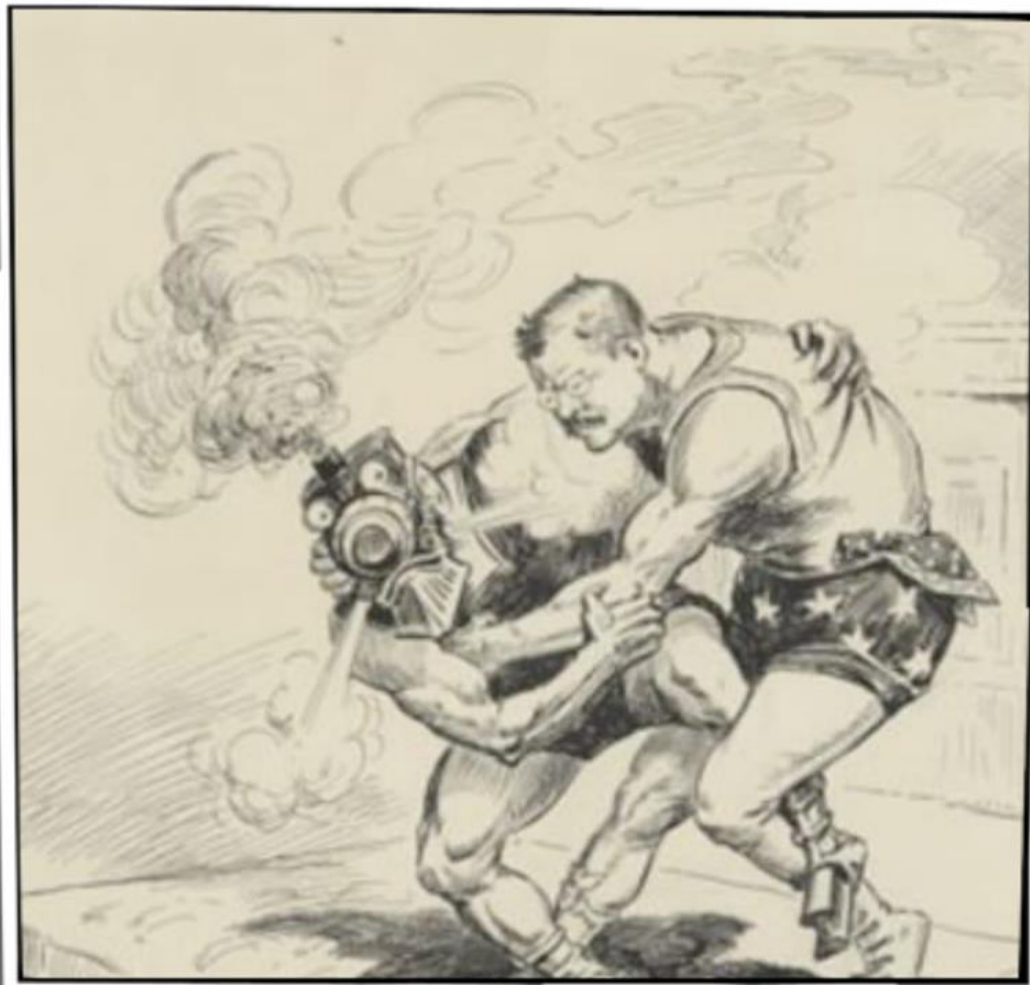
ROOSEVELT WRESTLES THE RAILROADS