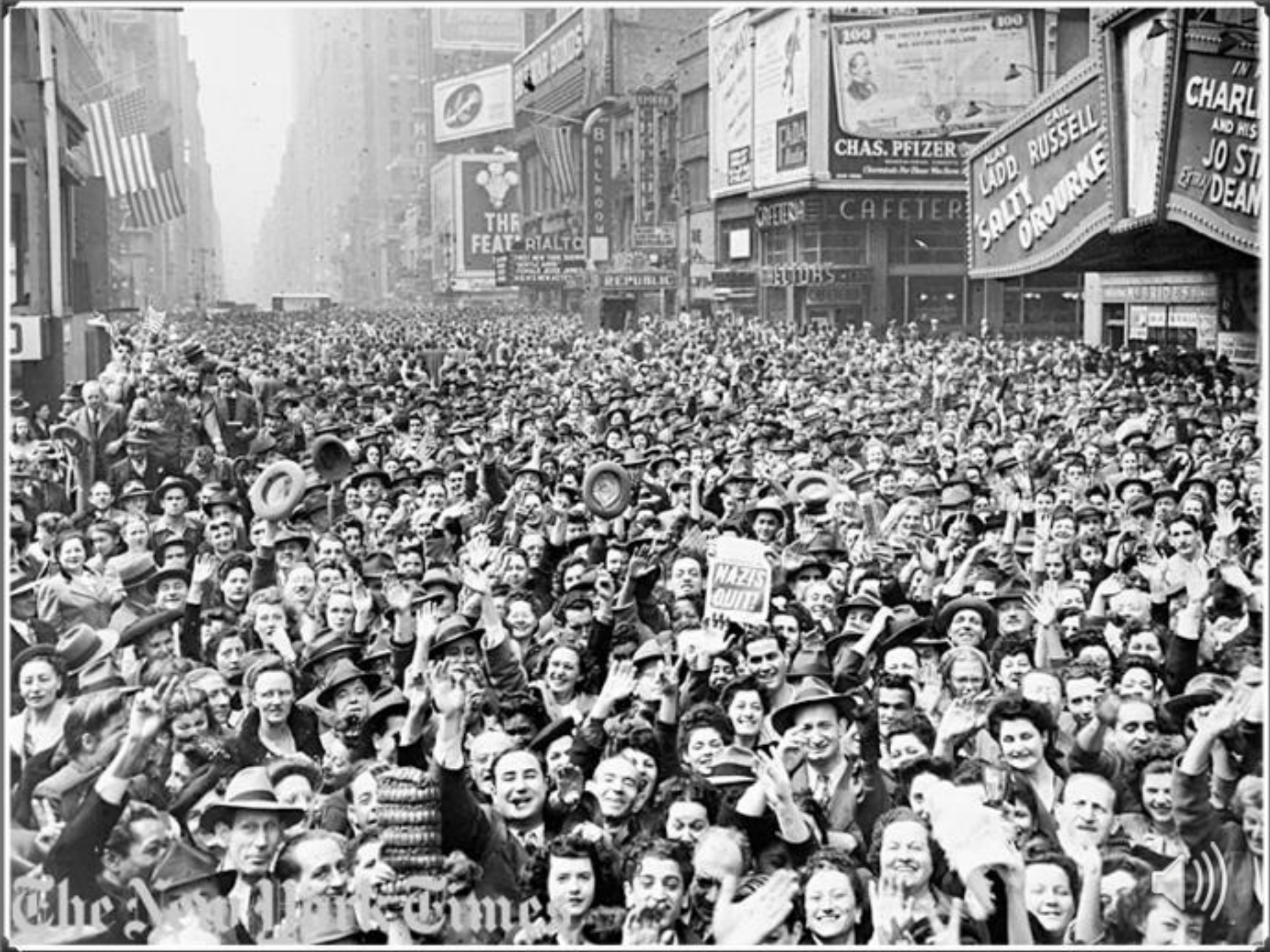
The Daily Worker